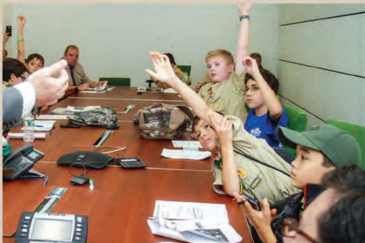
Merit Badge ProSeries: New York Times