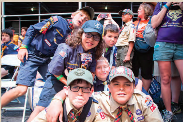
Good times at the 2016 Pinewood Derby

This was an exciting year, with new programs and activities that inspired young people to challenge themselves and contribute to their communities. Here are just a few highlights.