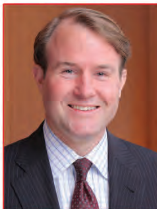
Commissioner Anthony Fiori