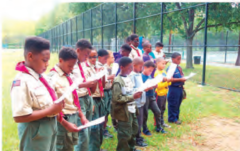
Over 35 Boy Scouts from Southeast Queens visited Rochdale Village Park in Jamaica for an urban camping experience. "The Scouts participated in all the major aspects of a wilderness camping trip, including sleeping in tents and having a cookout over an open campfire."