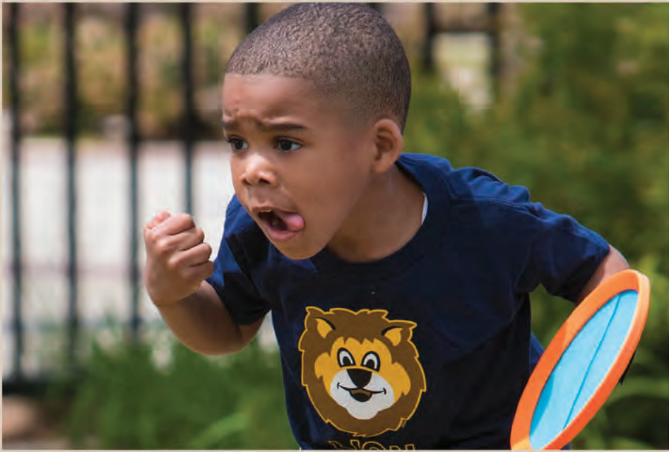
A roaring Lion Scout with his game face on.

>> New Lions Program: In 2016, 228 young boys were introduced to Scouting. It has been a “roaring” success. Kindergarten-aged boys are very eager to explore the outdoors, venture off, and make new friends. It’s still a bright, new world full of curiosity for them, and we’re here to teach them how to maneuver through it. Lions recruitment to the Cub Scouts has been a tremendous success. At this young, extremely impressionable age, our Lions are learning new skills, developing great early teamwork attributes and implementing them all while having the time of their lives!