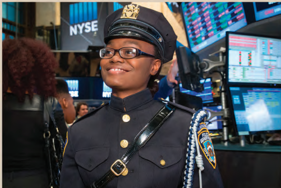
Law Enforcement Explorer at the NYSE

Over 230 young men and women participated in the three-week academy, which brings students to classrooms at Fordham University for two weeks and to Camp Keowa for one week of drills, scenarios, zip lining, ropes courses, and other outdoor adventures in upstate New York. The Academy culminated in a graduation ceremony at One Police Plaza hosted by the NYPD.